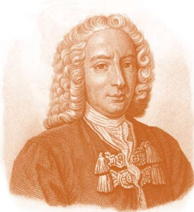
Daniel Bernoulli, an 18th-century Dutch-Swiss mathematician, pioneered work in probability and statistics.

Probing a little deeper, we discover that this calculation uses the conceptual device of an ensemble of infinitely many identically prepared systems, or copies of our universe. The ensemble average simultaneously considers all possible paths along which the universe might evolve into the future. The fraction of systems from the ensemble that follows some scenario is the probability of that scenario, and summing the possible outcomes and weighted with their respective probabilities amounts to taking an average over all possible universes.