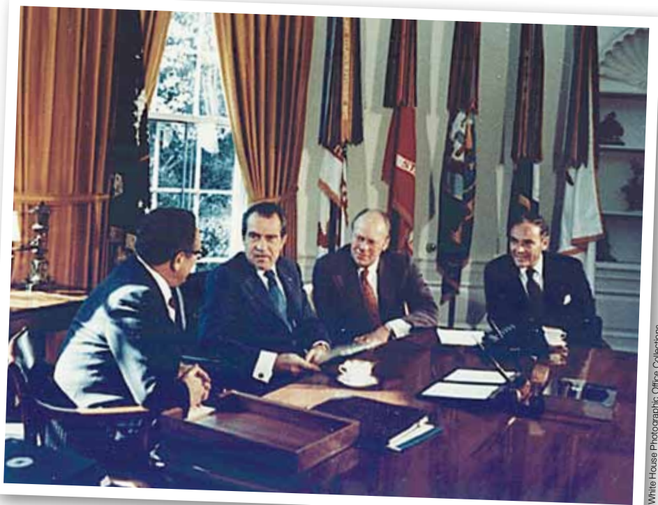
President Nixon meeting with Secretary of State Kissinger, Vice President Ford, and Chief of Staff Alexander Haig in Oval Office