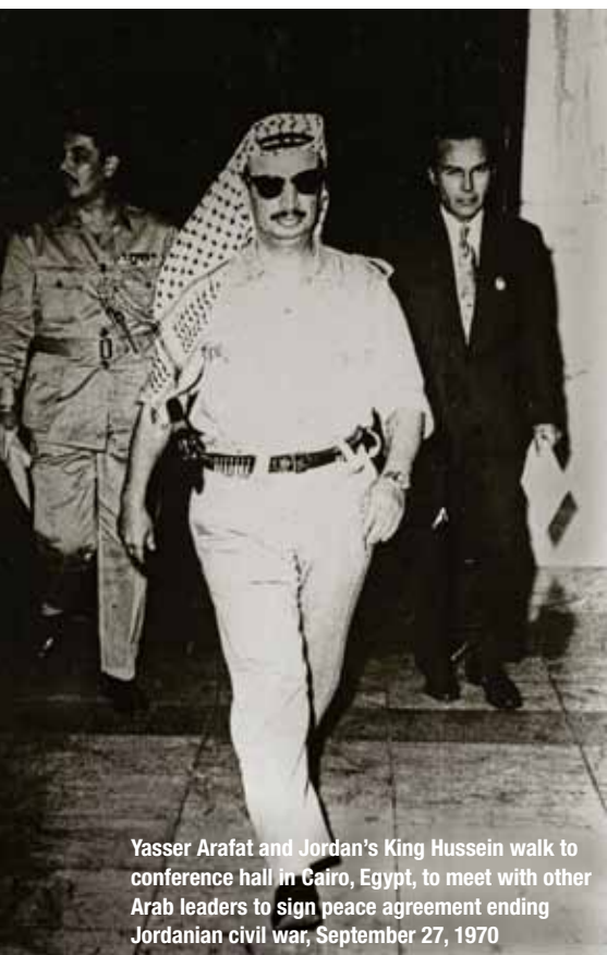
Yasser Arafat and Jordan’s King Hussein walk to conference hall in Cairo, Egypt, to meet with other Arab leaders to sign peace agreement ending Jordanian civil war, September 27, 1970

Syrian and Iraqi public threats against King Hussein between September 17 and 19 raised the possibility that the carriers would soon see combat. President Hashim al-Atasi claimed that Syria would “spare no blood” to help the Palestinians, an insinuation that Damascus might send forces into Jordan. On September 17, Radio Damascus echoed this theme by reporting that the Syrian foreign ministry had warned Jordan’s ambassador that the “Syrian revolution cannot remain