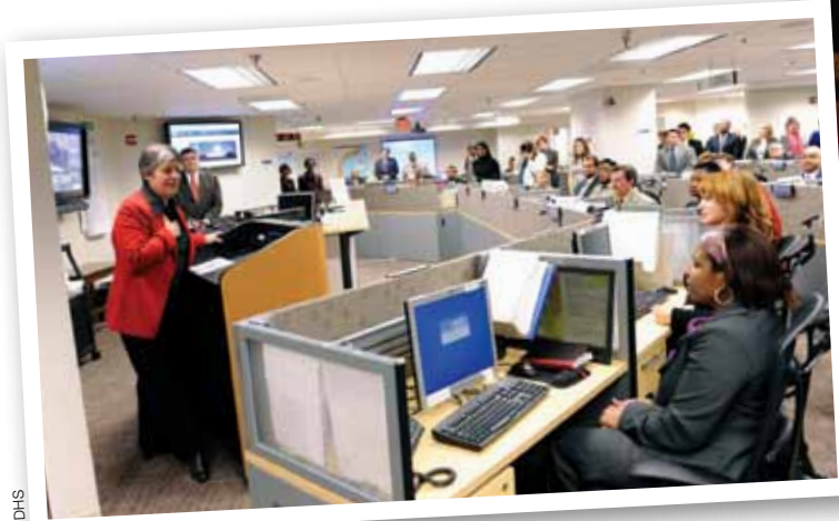
Homeland Security Secretary visits Federal Emergency Management

As one interviewee noted, risk management is at the heart of all the Department does. Inherent in every decision is a prioritization, implicit or explicit, of the risks DHS chooses to address. While some of the threats facing the Nation are knowable (for example, floods cause an average of $8 billion worth of damage every year), others—particularly terrorist threats are inestimable. The two questions that then face DHS are what threats to focus on, and how to address them. The current approach