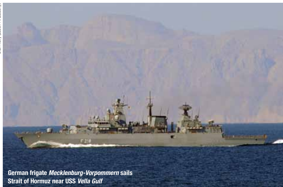
German frigate Mecklenburg-Vorpommern sails Strait of Hormuz near USS Vella Gulf

The third dynamic altering the current global energy market is the increasing importance of environmental concerns in determining importing states' energy policies. Whereas