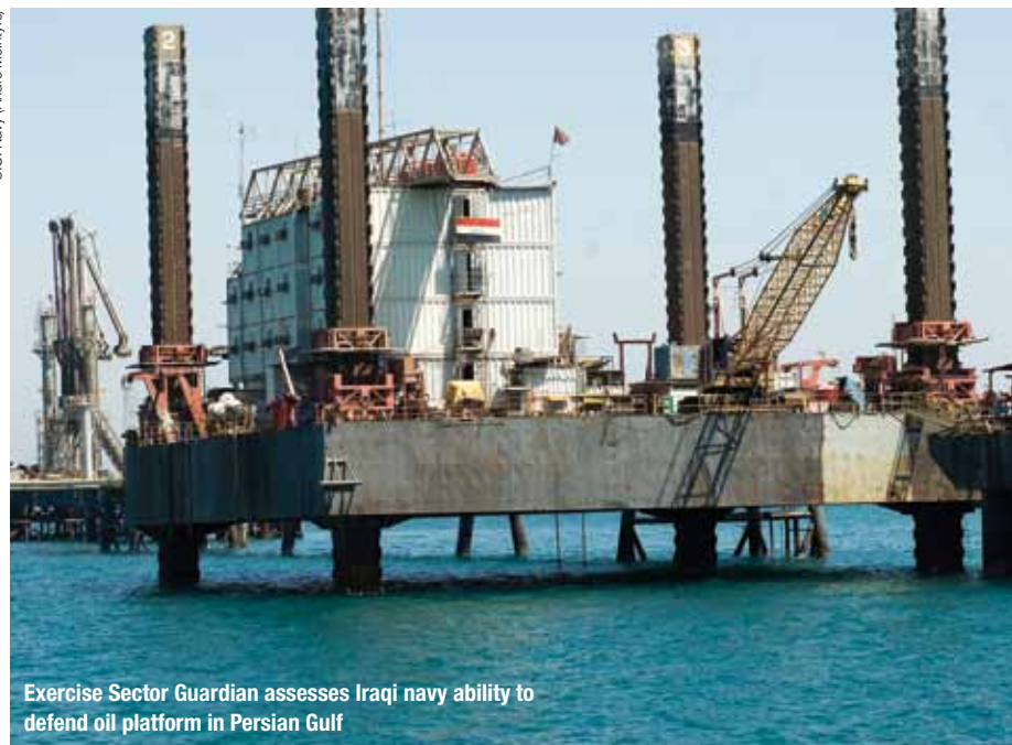
Exercise Sector Guardian assesses Iraqi navy ability to defend oil platform in Persian Gulf

For more than a century, global energy supply has been dominated by international corporations competing to find and extract energy resources for profit. The result has been that known reserves have expanded faster than demand, and prices have usually remained low. Petroleum, in particular, has averaged around $20 per barrel in inflation-adjusted dollars for nearly a century. 12 While energy-exporting nations have attempted to coordinate their export policies to reduce supplies and increase prices, the large number of exporting states and the critical role inter-