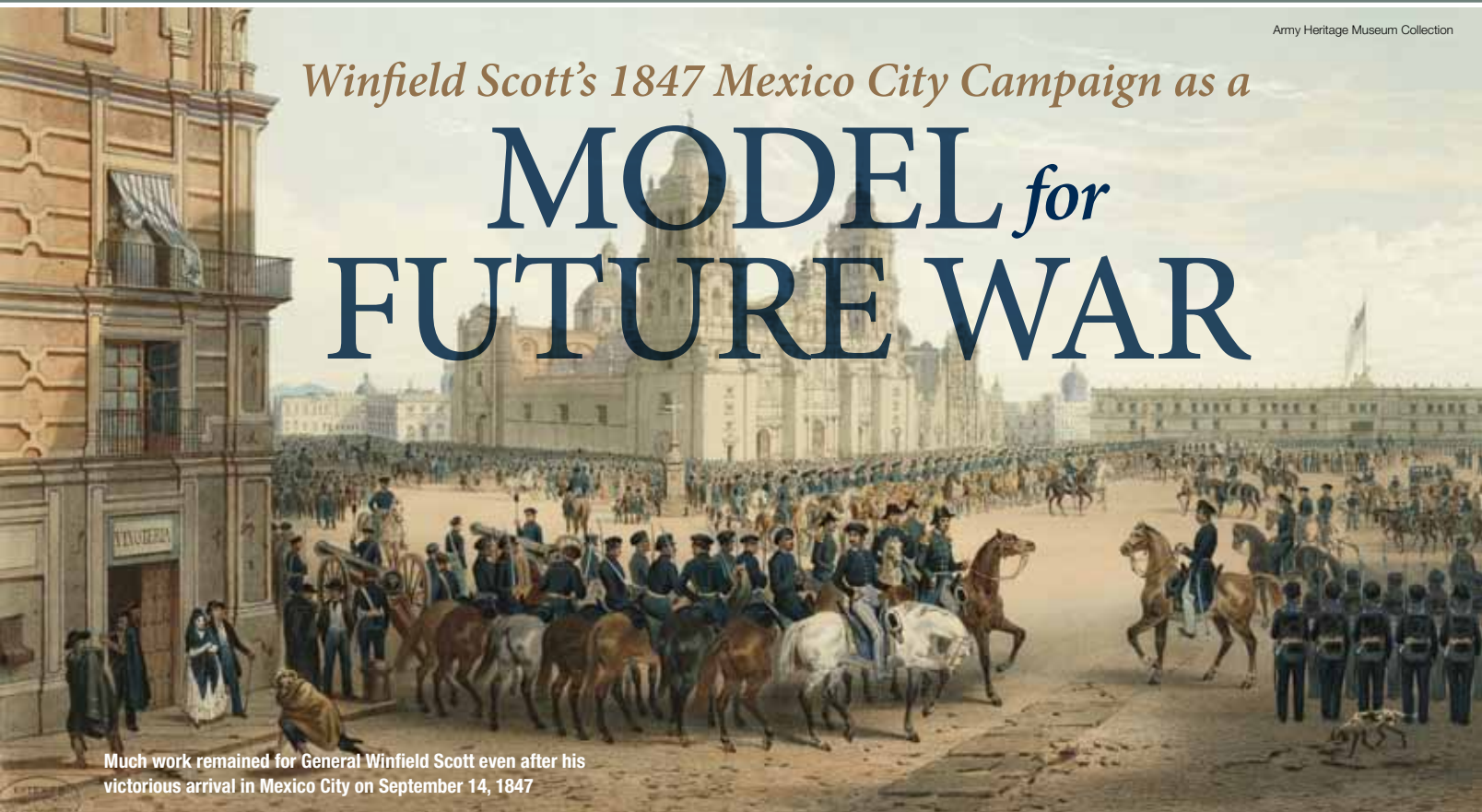
Much work remained for General Winfield Scott even after his victorious arrival in Mexico City on September 14, 1847

O ur fixation with conventional battle tends to undervalue the increasing potential of stability operations to decide the political outcomes of military campaigns and clouds our perceptions regarding both the purpose and utility of force. 1 This article uses an abbreviated examination of Winfield Scott's Mexico City campaign to provide perspectives on both the evolving character of warfare and the preeminent challenge confronting America's contemporary operational planners—that is, how to translate ascendancy on the conventional battlefield into achievable and enduring political success. While not dismissing the possibility of traditional, high-intensity, interstate warfare, this article argues that both the character and conduct of America's future conflicts will, in all likelihood, more closely resemble those of Scott's campaign than the black and white political and military paradigms of a bygone era where industrialized nation-states waged near-total wars of annihilation.