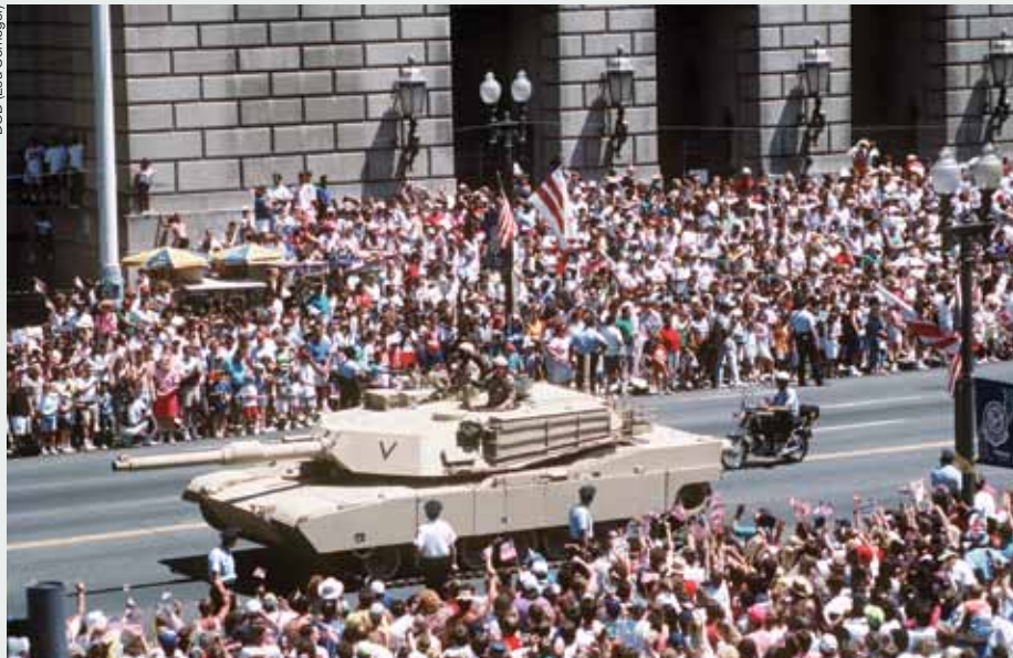
Soldiers drive M-1A1 Abrams tank in victory parade honoring coalition forces of Operation Desert Storm

If the United States hopes to consummate military success with enduring political victory in the 21 st century, it will need to reconcile the American way of war with the realities of the contemporary operating environment. While offering no clairvoyant panacea, Scott's campaign provides valuable perspective on how to do so. Operating 156 years before the American invasion of Iraq, Scott prosecuted a bold and imaginative campaign that carefully balanced military means with political ends. His skillful integration of anti-guerrilla, stability, and high-intensity combat operations precluded the eruption of a widespread, religious-based insurgency and consummated his tactical victories with enduring political success. In the future, as in the past, it will not be enough to simply destroy or defeat the enemy's armed forces; the American military will have to be able and ready to win the peace within the construct of an overarching campaign design focused on securing a definitive political, not just military, victory.