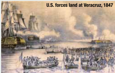
U.S. forces land at Veracruz, 1847

On April 2, Scott's intrepid and undermanned army boldly turned its back on the sea and raced for Jalapa (elevation 4,680 feet), a small but important town located 74 miles inland, just above the Yellow Fever belt. On April 18, Scott's 8,500 effectives shattered Santa Anna's well entrenched 12,000-man advance guard at Cerro Gordo. With the road to Jalapa now open, Scott pursued the remnants of Santa Anna's army deep into central Mexico. On May 15, the U.S. 1 st Infantry Division, under the command of Brigadier General William Worth, entered Puebla (elevation 7,091 feet, population 80,000) without a fight. Scott's success, however, proved precarious. He did not have enough men to secure his