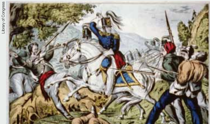
Mexican troops ambushed a squad of U.S. Dragoons, killing 14 Americans, April 1846

More importantly, the general reinforced words with decisive action. Scott moved quickly to impose order on the local population and ensure the discipline of his own troops. He instituted martial law, employed local laborers to clean and repair the city, opened the port to foreign trade, installed one of his division commanders as military governor, and reopened the city's shops. The general also made unprecedented overtures to local religious leaders. American troops were required to salute Catholic priests. Scott, himself a devout Protestant, took the unprecedented step of attending Catholic Mass with the newly installed civil governor and their combined staffs. 15 In retrospect, Scott's astute handling of the civil population remains one of the least appreciated aspects of the campaign. It was also one of the