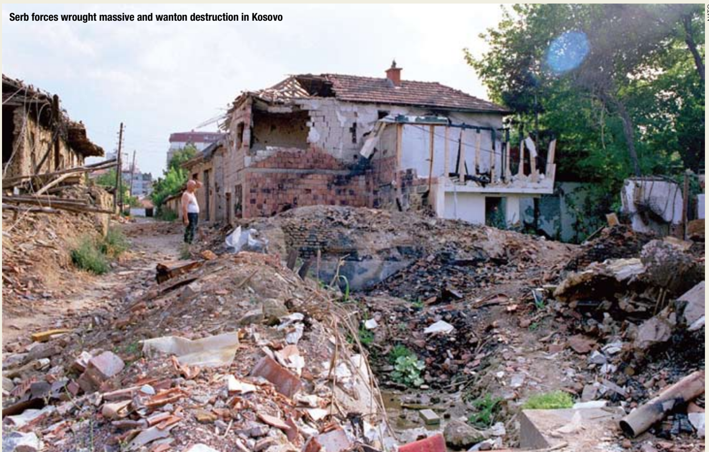
Serb forces wrought massive and wanton destruction in Kosovo

understanding that commanders have unique responsibilities to ensure their troops' observance of the law of war, Article 87 sets out what a commander must do to meet those obligations