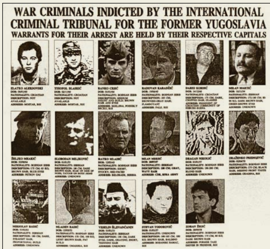
International War Crimes Tribunal, founded by UN resolution in 1993, has mandate to prosecute and try violators of international humanitarian law

clearly defines a process that the executive branch must follow for interrogations and prosecutions of prisoners captured in the struggle against extremism. The issues of capture, interrogation, prosecution forums, and detention all are part of the same chain