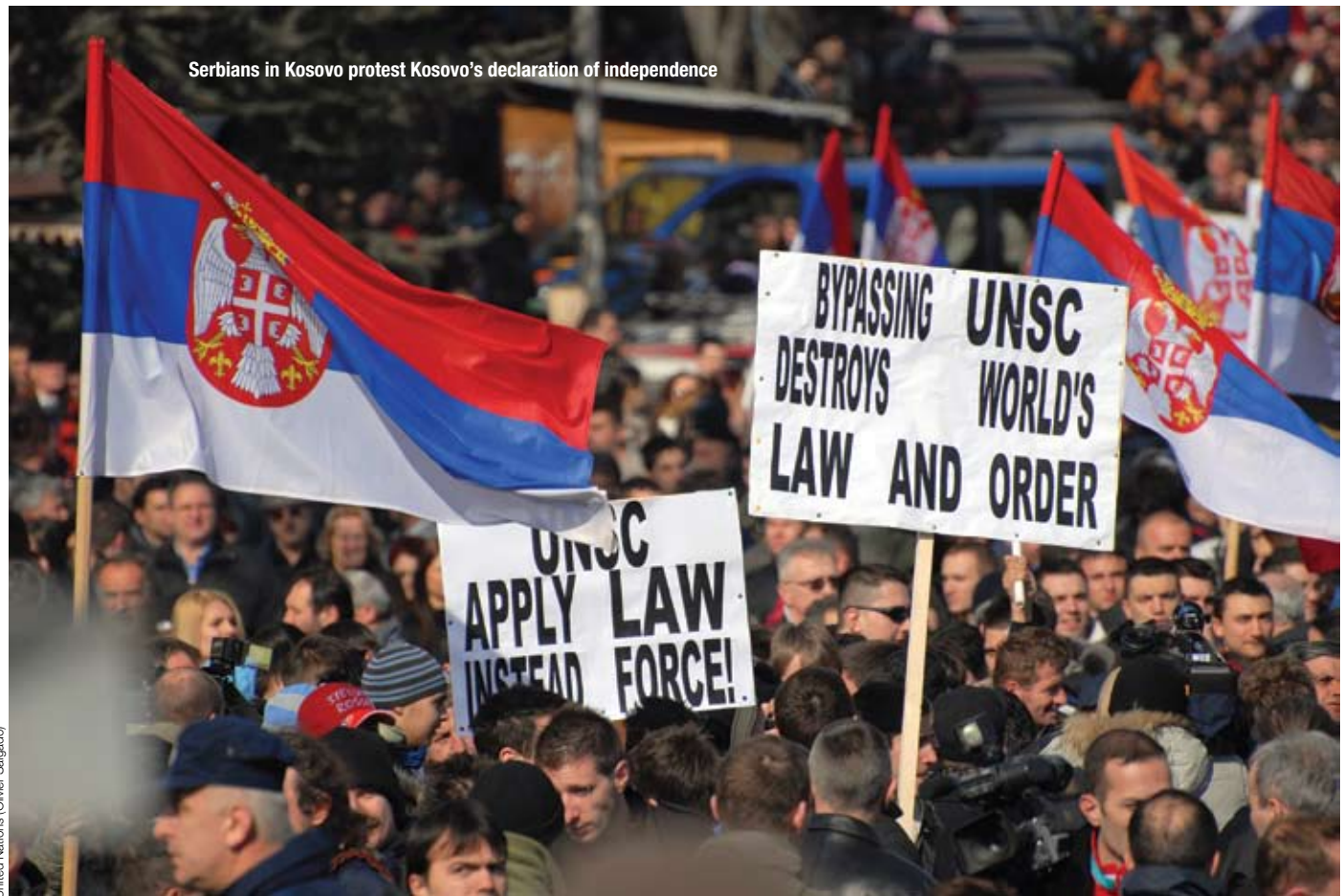
Serbians in Kosovo protest Kosovo's declaration of independence