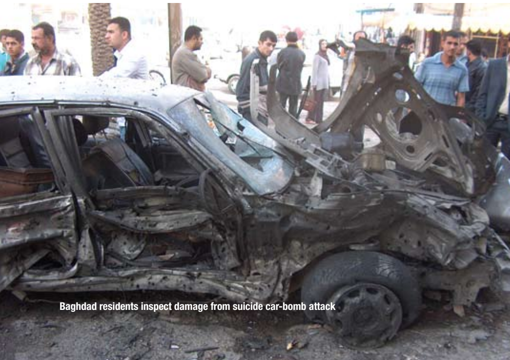
Baghdad residents inspect damage from suicide car-bomb attack

A third quality community conflicts share is that they are hard to end. Data suggest that in any given year over the last decade, most active conflicts have been going on for some time. According to Dan Smith, in 1999, for example, 66 percent of existing conflicts were more than 5 years old, and 30 percent were more than 20 years old. 9 No participant usually is in a position to claim victory. Several of the conflicts that now disfigure the global landscape have lasted for many years at a low level. Others have gone into abeyance following conclusion of a ceasefire or peace agreement, but they have resumed (as happened recently in Sri Lanka and Azerbaijan). The reasons for the difficulty in truly ending contemporary conflicts are many: one or more parties are insincere and use the hiatus to rebuild combat capability; one or more are disappointed with political or other developments following the agreement; one side or the other may fragment, with more radical elements continuing to resort to violence; or the underlying causes of the conflict are not addressed.