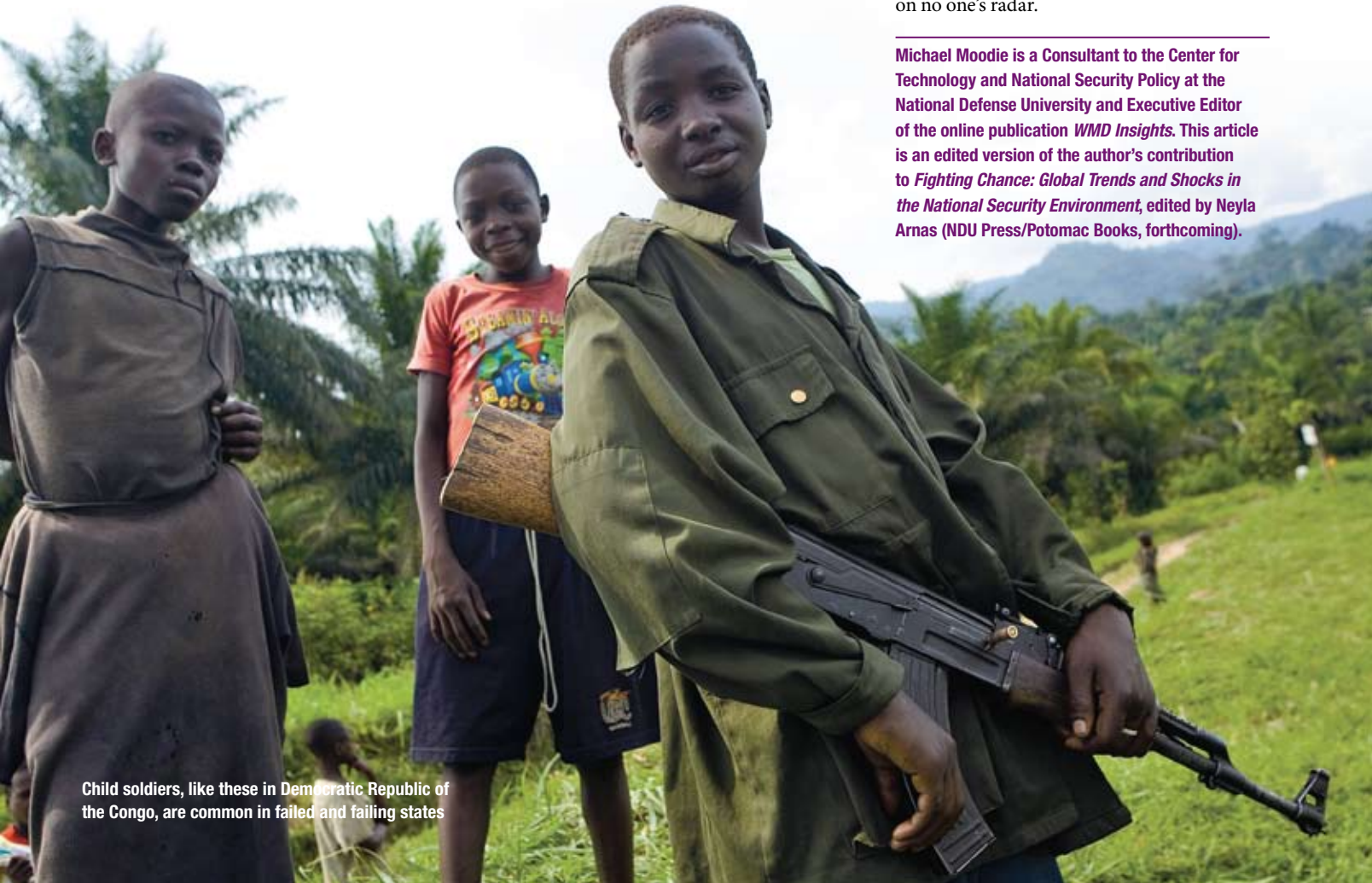
Child soldiers, like these in Democratic Republic of the Congo, are common in failed and failing states

A s the Cold War was coming to a close, most of the world had never heard of the small Yugoslavian provinces of Bosnia-Herzegovina or Kosovo, let alone believed they would demand global attention. Nor would the world have believed that a state such as North Korea, deemed a “basket case” in many fundamental functions of government, would acquire nuclear weapons and maintain chemical and biological capabilities. A global network of extremists based on the perversion of one of the world’s great religions that was willing to resort to sustained acts of violence resulting in the deaths of thousands of civilians was a scenario worthy only of a movie script. The identification of U.S. national security priorities as waging a “global war on terror” and the deployment of tens of thousands of U.S. troops to preempt a “gathering” threat to the Nation’s security—troops who would then become engaged in a protracted attempt to create a democratic nation-state in the midst of a civil war—were on no one’s radar.