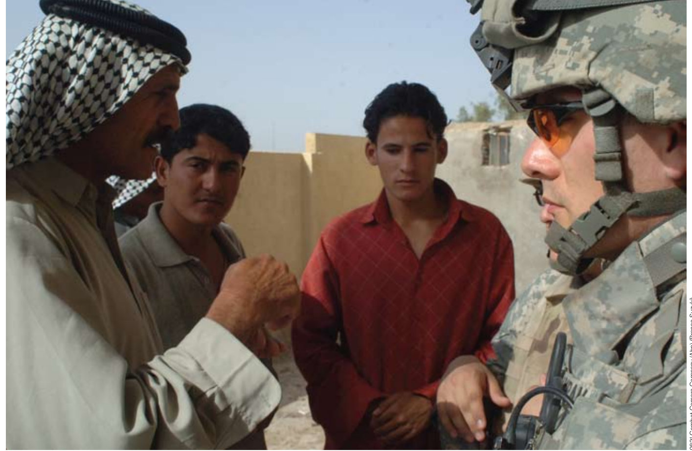
Tribal leaders in Iraq are turning away from extremist agendas

ndupress.ndu.edu issue 52, 1st quarter 2009 / JFQ 89