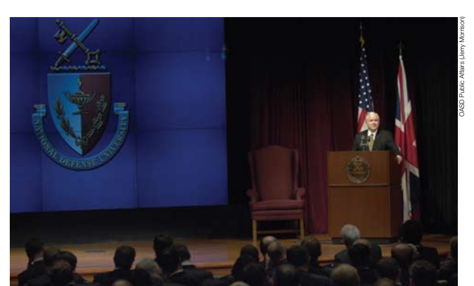
Secretary Gates addresses international students at National Defense University

Professional military education is a powerful draw and represents a singularly important engagement opportunity. The concept of jointness has attracted the interest of many national and military leaders of key partner states. The demonstrated effectiveness of the U.S. joint force has led to a desire among