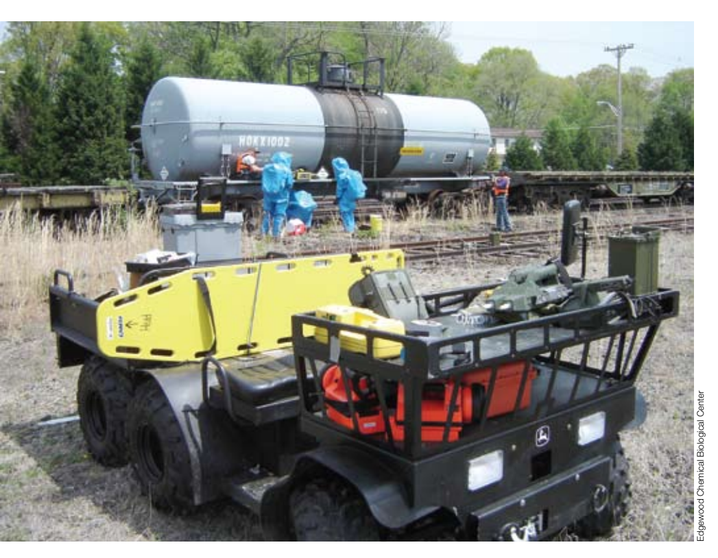
National Guardsmen train in chemical and biological incident management

tion problem more complex and difficult to manage. Technologies with legitimate uses that could be applied to unconventional weapons continue to spread globally at a rapid rate, and the growing demand (and competition) for energy, in particular, has the potential to fuel nuclear proliferation pressures in strategically important and sometimes unstable regions. Politically, globalization has contributed to the erosion of traditional state power and boundaries and served to empower both smaller states that are seeking to challenge the status quo and nonstate actors-ranging from individuals to transnational networks-with independent and often extremist agendas. The results are clear enough: proliferation challenges from states whose WMD programs confer on them disproportionate strategic importance; growing interest on the part of terrorists to acquire