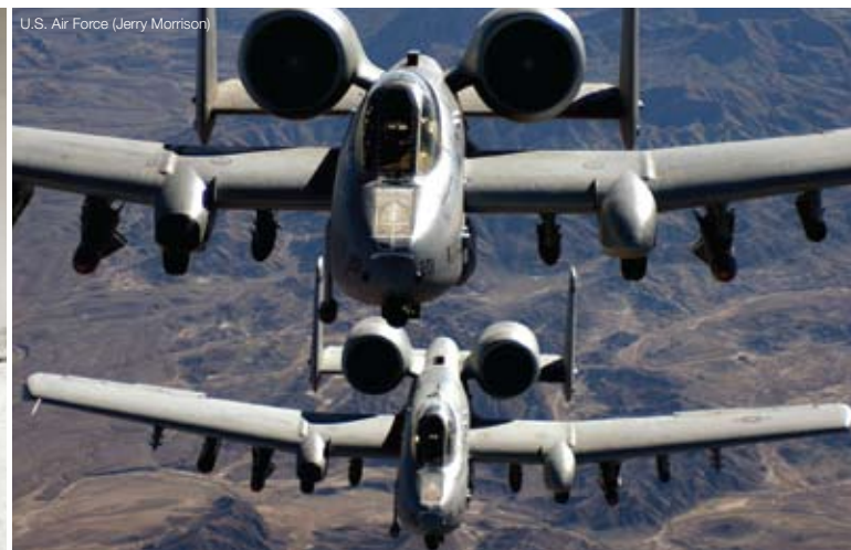
A-10As on mission over Afghanistan, November 2002