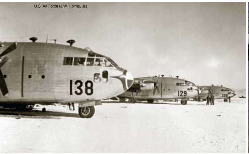
USAF C-119s at Yonpo, Korea, prepare for cargo airdrop to 1st Marine Division at Chosin Reservoir, 1950