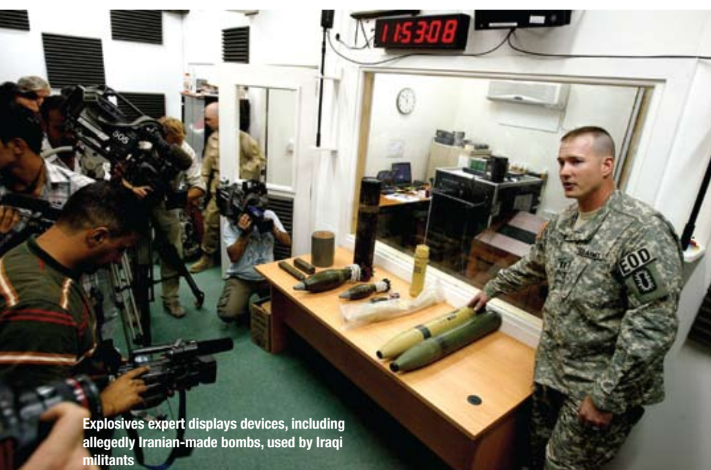
Explosives expert displays devices, including allegedly Iranian-made bombs, used by Iraqi militants

For its part, the FBI announced on September 30, 2007, that it will become more focused and specialized in its approach to terrorist groups, specifically mentioning Hizballah. The bureau has begun the largest, most comprehensive reorganization of its counterterrorism division since 2001. This change in structure is designed to help the