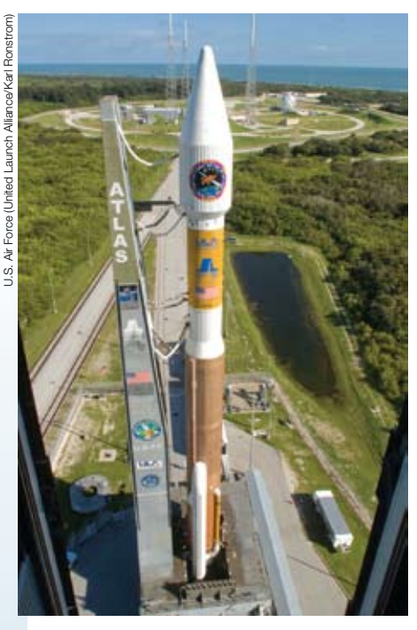
Next-generation communications satellite readies for launch

Capitalizing on the Desert Storm experience, the Air Force focused its efforts on enabling warfighters to leverage space capabilities by creating the Space Warfare Center in 1993.2 This led to the rapid exploitation of space capabilities such as GPS, satellite communications, and national space systems to enhance joint warfighting tasks. Space capabilities allowed quicker recovery of downed pilots, fostered the development of extremely precise GPS-aided munitions, and enabled a Global Broadcast Service to pump previously unimagined amounts of data to and from theater warfighters. Air operations in the Balkans would later validate that GPS could dramatically enhance the precision and lethality of weapons systems—effectively revolutionizing the American way of war.