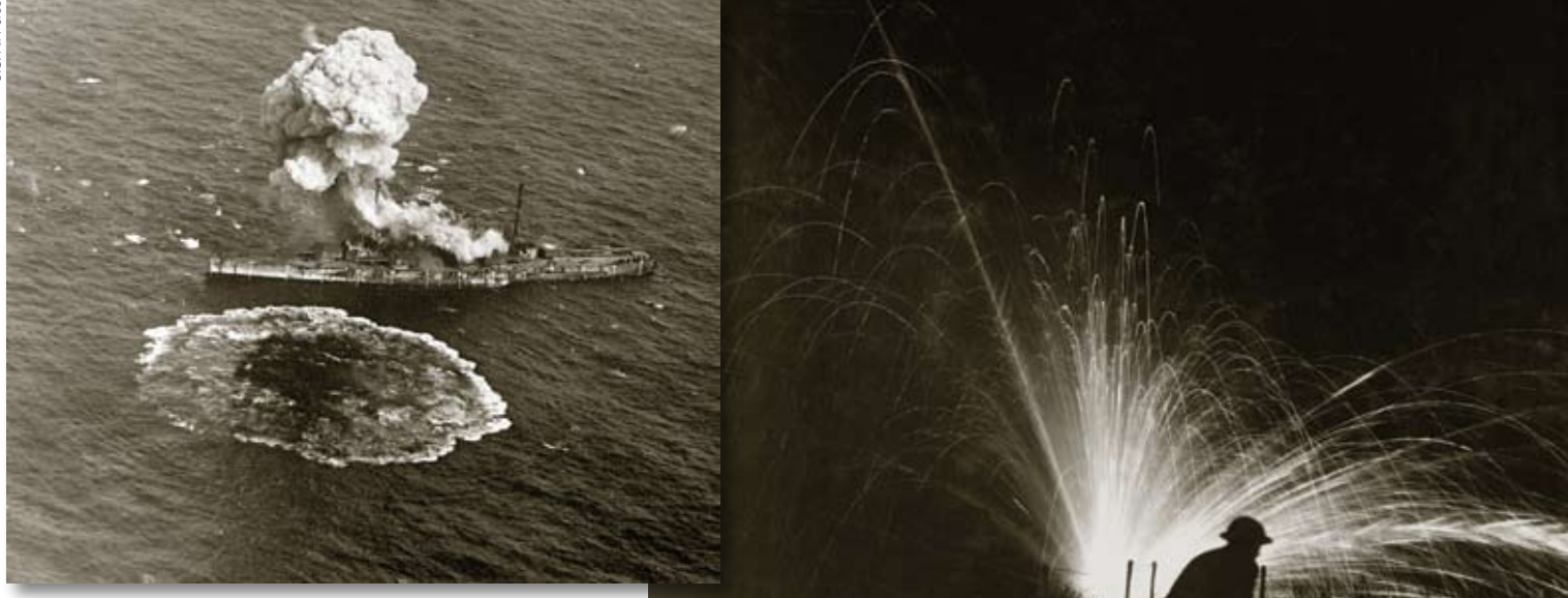
Billy Mitchell's 1<sup>st</sup> Provisional Air Brigade conducted controversial bombing tests against ships in 1921