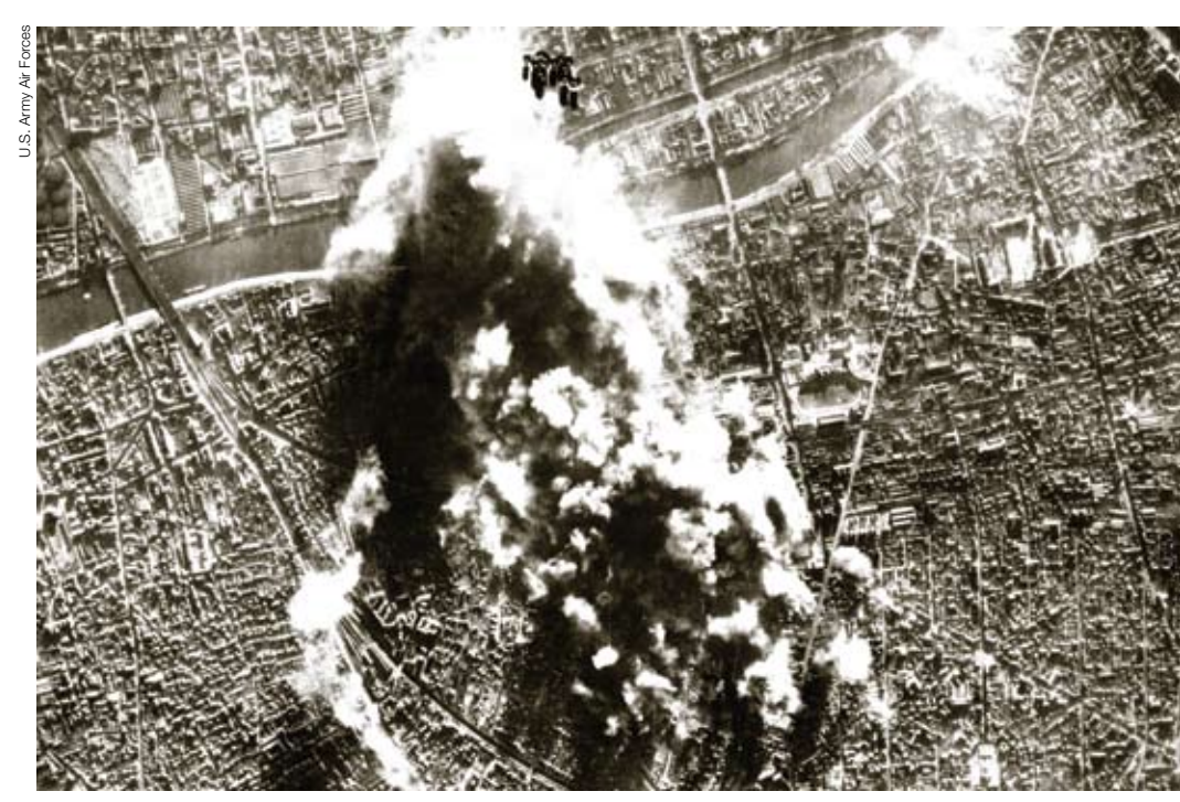
8th Allied Air Force bombs aircraft plant in Paris, December 1943

Unfortunately, faith, not fact, has underpinned airpower's progressive promises. That faith cannot remove friction, nor can it make bombing an effective political instrument in today's conflicts. Airpower has many valuable attributes for the wars in Iraq and Afghanistan, especially its nonlethal applications such as reconnaissance and airlift. Bombing, however, is not the answer to achieving political goals in such unconventional conflicts, and to view it in progressive terms is to make a grave error that will likely lead to unwelcome repercussions.