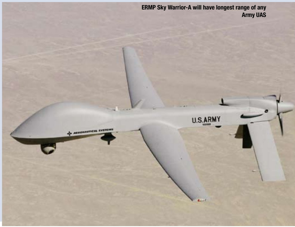
General Atomics Aeronautical System:

the General Atomics Sky Warrior A UAS into Task Force ODIN (Observe, Detect, Identify, Neutralize), an integration of manned/ unmanned systems, new technologies, and nonstandard equipment conducting counterimprovised explosive device (C–IED) missions in Iraq. By combining advanced sensors, tactical RSTA, and MUM teaming of UAS, attack and reconnaissance helicopters, and air assault aviation assets, Task Force ODIN has been able to maximize combat power and employ lethal and nonlethal effects to deny the enemy a permissive environment to operate.