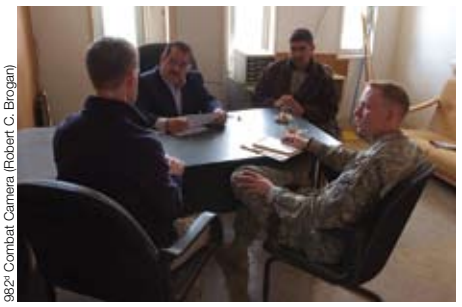
Army captain and State Department representative meet with Iraqi Education Ministry officials about expanding teaching programs

Personnel systems must adapt to incentivize people to serve in high-risk countries. All agencies must strengthen their personnel