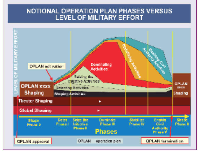
Figure 1. Shaping Activities Critical Across All Phases of Conflict

Besides the sweeping AEF transformation, the Air Force has also developed Contingency Response Groups (CRG) to rapidly set up expeditionary bases and serve as USAF "first responders" in crises ranging from humanitarian relief to major combat operations. Beginning with the Germany-based 86 CRG, activated in February 1999, the USAF has added three CRGs in New Jersey, three in California, and one in Guam. In December 2006, the Kentucky-based 123 CRG became the first such unit in the Air National Guard.9 Integrating over 100 personnel from security forces, communications, intelligence, aerial port, and other specialties into one organization, CRGs enable the application of airpower to stability as well as combat operations. For instance, the 86 CRG deployed to Albania in 1999 and began controlling humanitarian flights within 4 hours for hundreds of thousands of Kosovo refugees.<sup>10</sup> CRGs also opened Indonesian airfields for tsunami relief in 2004 and enabled earthquake relief in Pakistan in 2005. These massive relief efforts significantly improved the U.S. image among Indonesians and Pakistanis.11 Given the population-centered focus