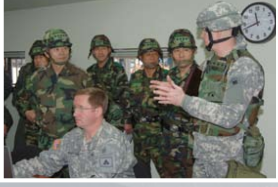
GEN Bell discusses Army Prepositioned Stock support with senior ROK military leaders

Upon its founding in 1948 and continuing even after the 1953 armistice agreement, the Republic of Korea has endured repeated cycles of intense North Korean unconventional warfare. Intent on subverting the governing ability of the democratic south and weakening the resolve of the ROK-U.S. alliance, North Korea employed agitation, propaganda, and terrorist acts, including assassinations of ROK civilians and government officials, as well as sporadic combat against ROK and U.S. forces. In the face of these threats, the alliance remained resolute in its defense of freedom. Serving alongside U.S. forces during the Vietnam War, the Persian Gulf War, Operation Enduring Freedom, Operation Iraqi Freedom, and on the Korean Peninsula, the ROK military has demonstrated superb competencies as well as a firm commitment to the international community.