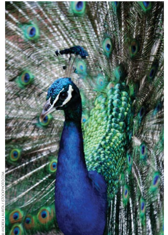
Sex has an evolutionary cost, as evidenced in the extravagant display of the male peacock

“What are the benefits that offset all these costs?” Michod asked.